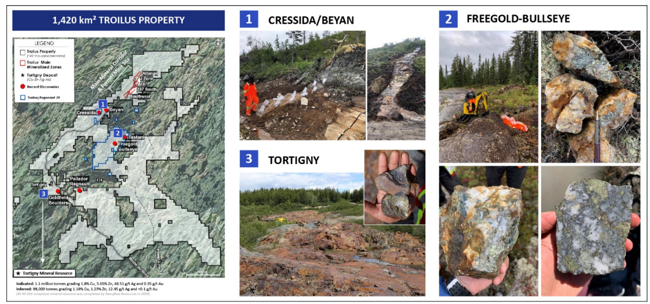
Figure 1: Troilus Property and Regional Exploration Targets