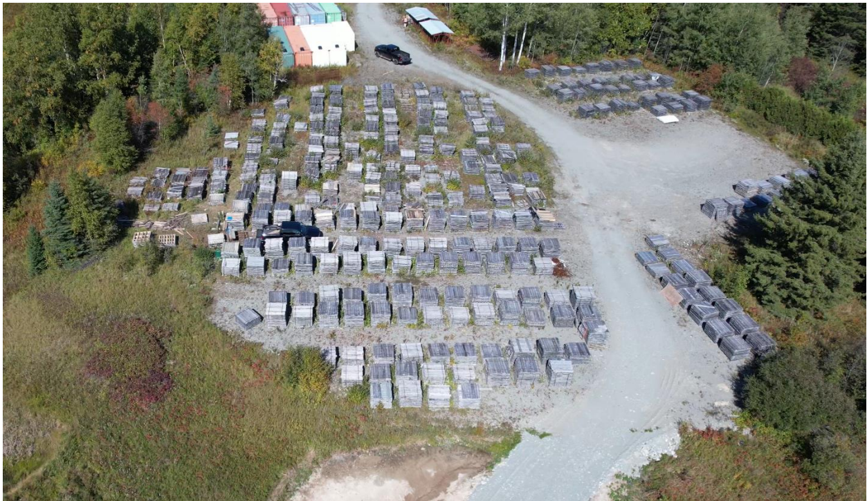
Image 3: Historical Core Library. Over 3,000 meters have been sampled related to the Phase 1 Open Pit Concept. Sampling continues.