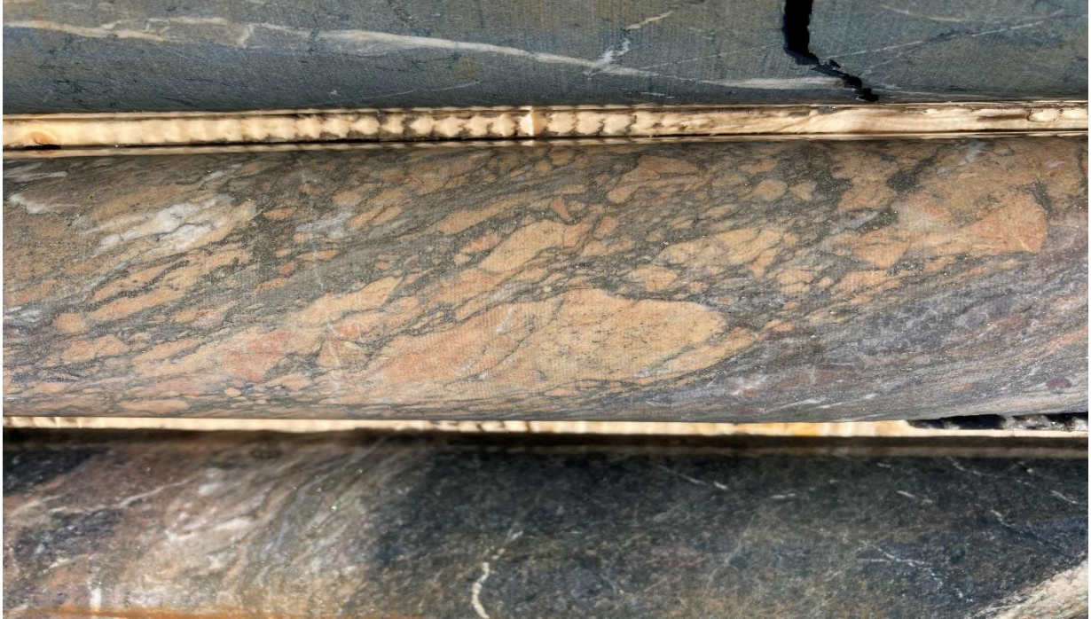
Image 2: Representation of mineralized and altered core from DQ23-09 (5.6 m of 7.5 g/t Au). Altered breccia zone in mafic volcanics; containing quartz veinlets, sericite, and ankerite.